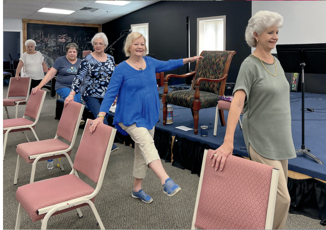
Steady for Life balance classes enjoy fellowship beyond class time with picnics, parties, trips, luncheons, seminars, plays and movies. Come join the fun.