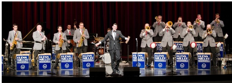
The Glenn Miller Orchestra

The Glenn Miller Orchestra, with its unique jazz sound, is one of the greatest bands of all time. Originally formed in March 1938, the present Glenn Miller Orchestra was formed in 1956 and has been touring consistently since, playing an average of 300 live dates a year all around the world.